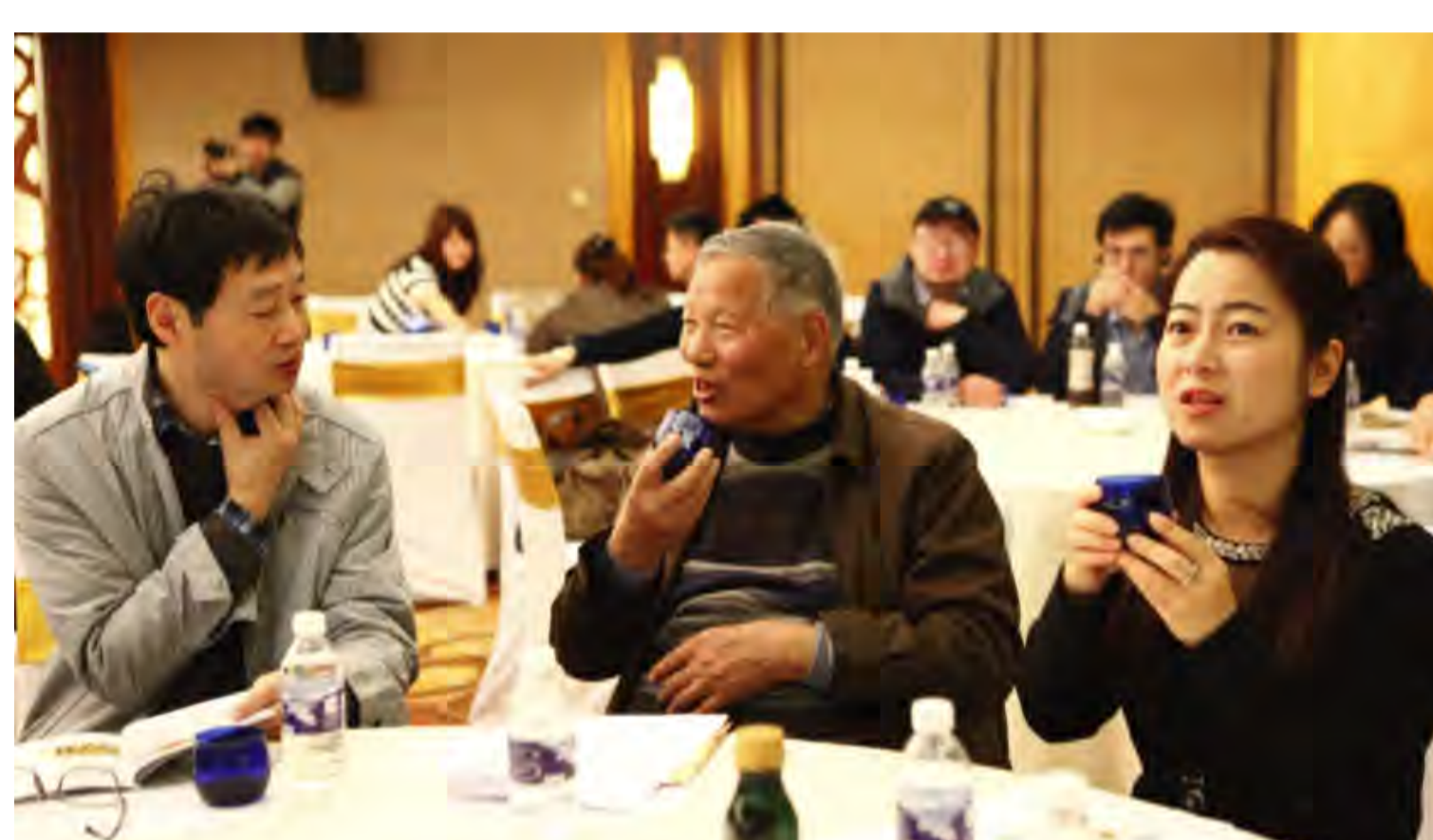
Press conference - Tasting session

In particular, our press conference aimed for press representatives, operators and opinion leaders in the extra virgin industry in Mainland China was particularly well received. The conference, featuring keynote speeches and presentations from top executives of the two Italian consortia, Italia Olivicola and UNAPOL, shed light on the latest trends and developments of the extra virgin olive oil industry and offered participants a great insight into such topics as quality control and traceability of extra virgin olive oil products which local market practitioners were eager to learn more about.