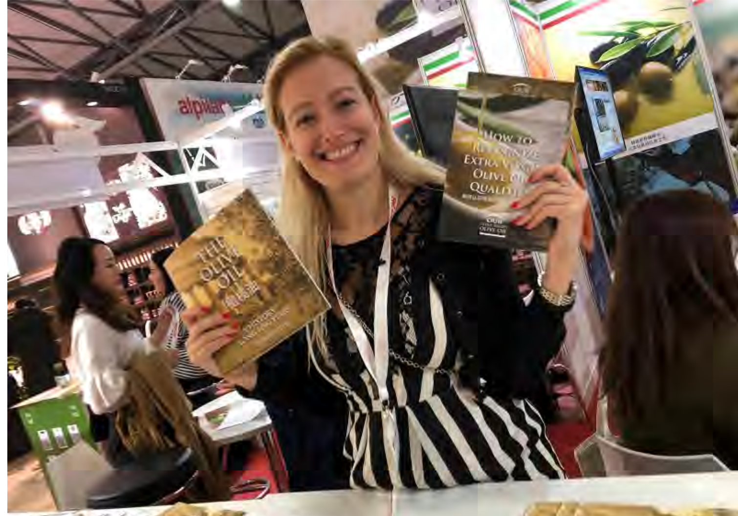
Our colleague at Shanghai Expo

To get up close and personal with our audiences, the TAICHI project went down to the Food & Hotel China 2018 Expo in Shanghai from November 13 th to 15 th . The three-day expo event proved to be a major success, drawing thousands of visitors eager to learn more about the TAICHI project and all the latest information about olive oil.