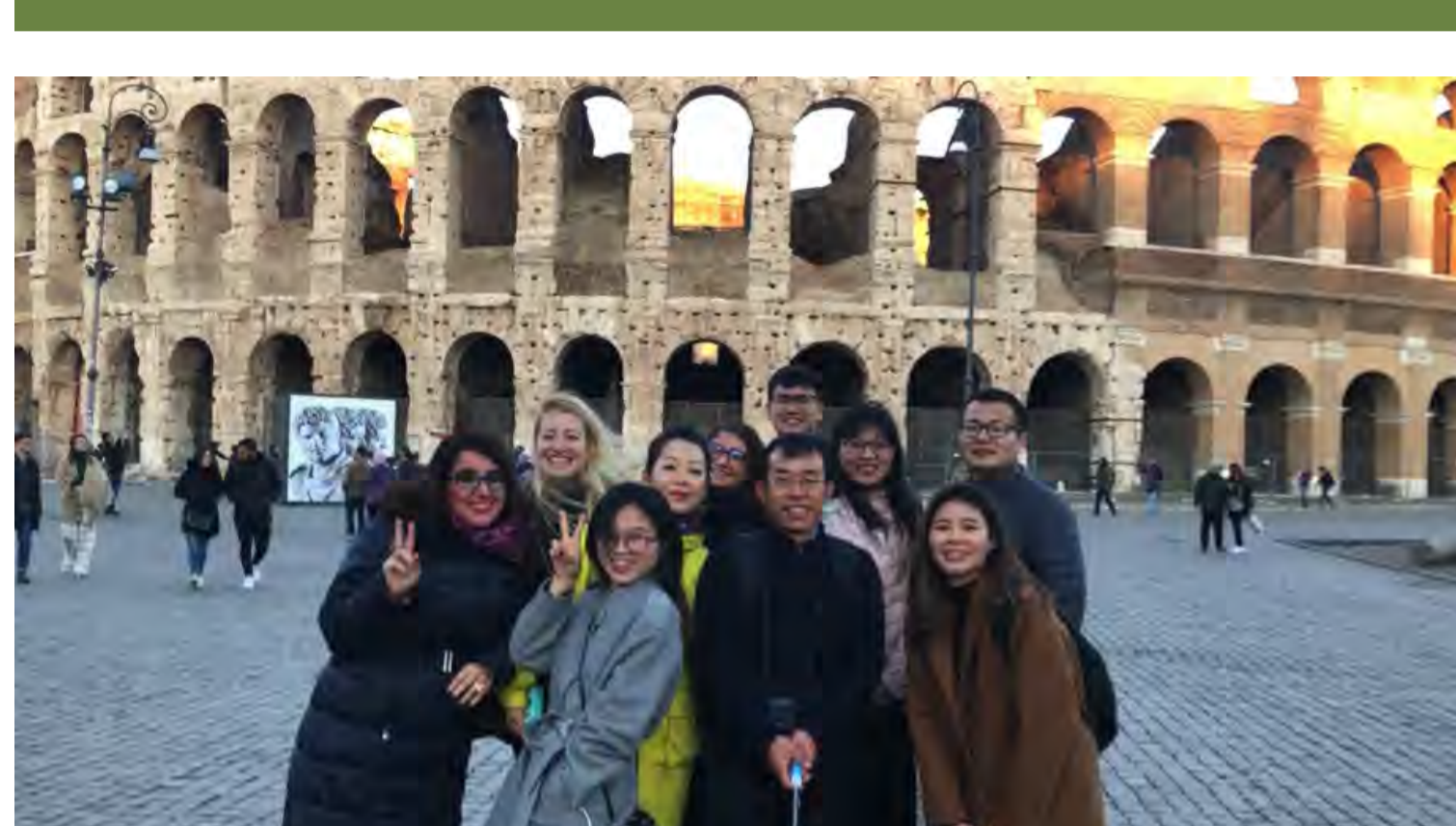
Greetings from Italy

After several months of much buzz and expectation, the free slots of an exclusive tour to Italy and Greece were finally filled. One lucky winner from Mainland China and one from Taiwan, along with five media representatives, gathered in the Eternal City of Rome on November 28 th , 2018 to embark on a tour of a lifetime – travelling to Italy and Greece and experiencing first-hand how olive oil is made in its homeland.